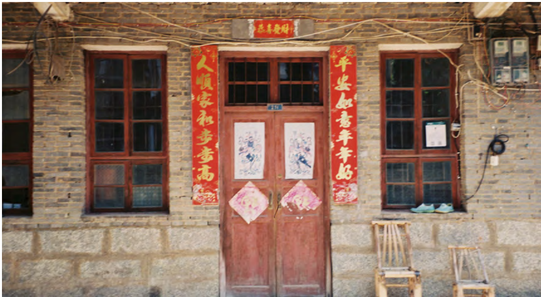
(March 25, 2019)