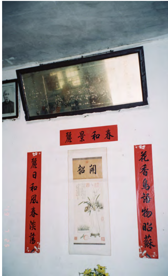
( July 25, 2019 )