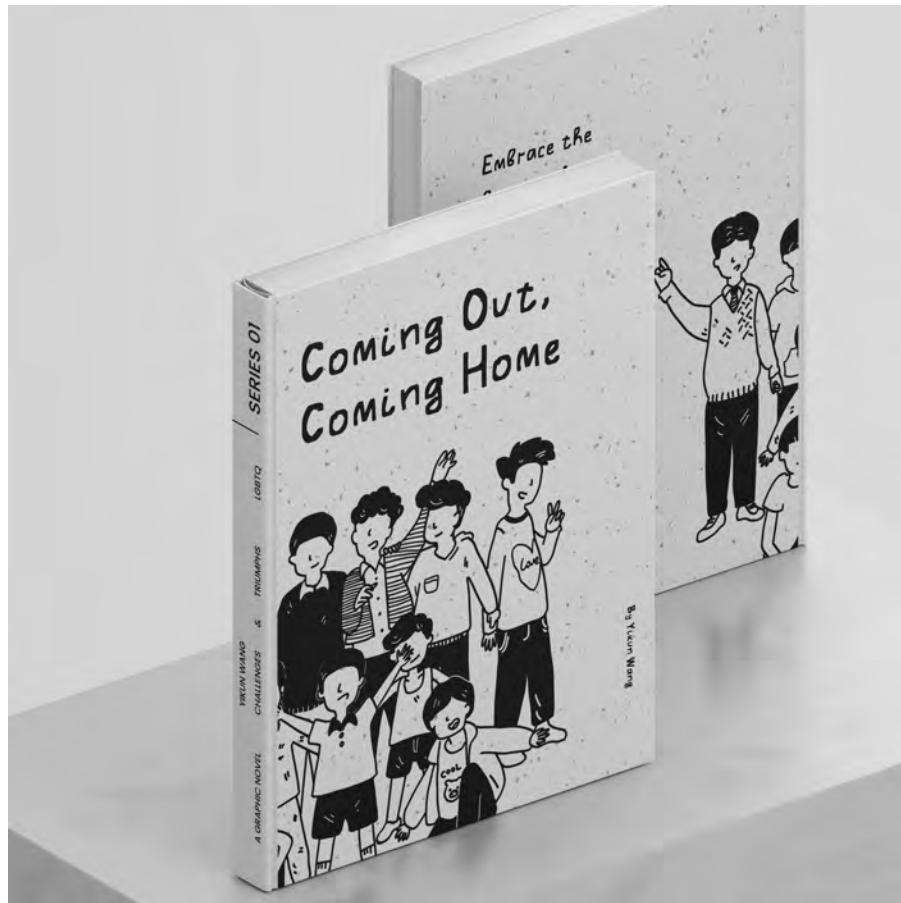
( The first series of the Coming Out, Coming Home novel )