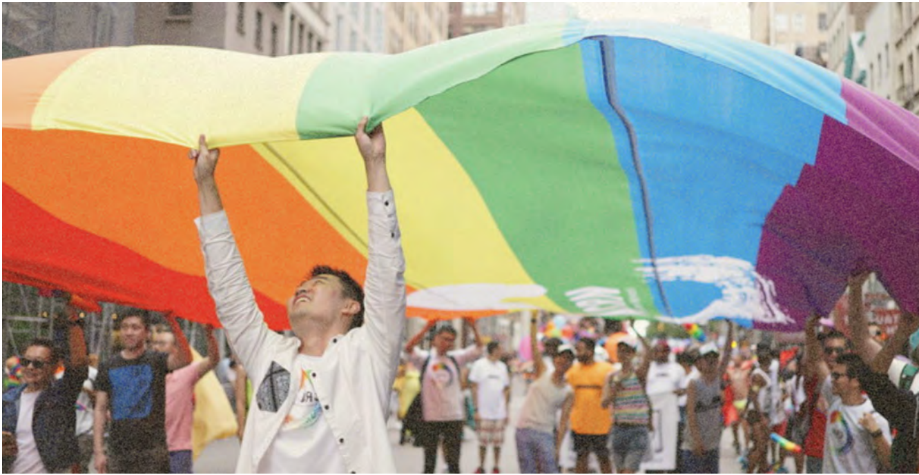
( Chinese Rainbow Network at the Pride Parade )