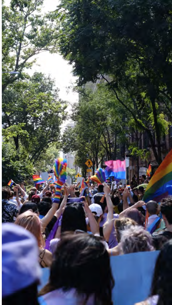
( June 26, 2022 )